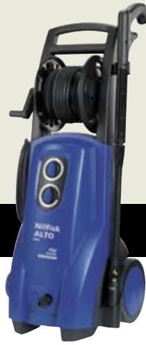
P 160.1-15 X-TRA