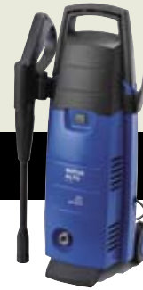
▲ C 110.1 X-TRA