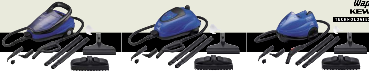
▲ STEAMTEC 5 IH