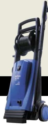
E 140.1-9 S X-TRA