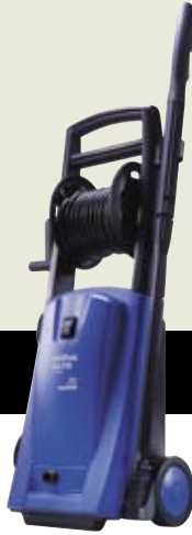
▲ C 120.1-10 X-TRA