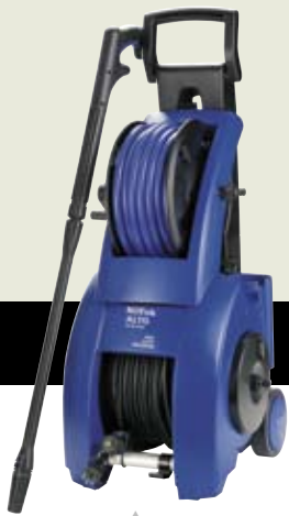
E 145.1-15 S X-TRA