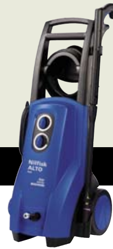
P 150.1-10 B

The Nilfisk-ALTO PRO range of products offers outstanding performance and is suitable for larger cleaning tasks round the house and for semi-professional tasks.