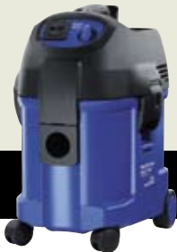
▲ CENTIX 60 CENTIX 60 PREMIUM