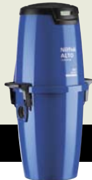
▲ CENTIX 50 PREMIUM