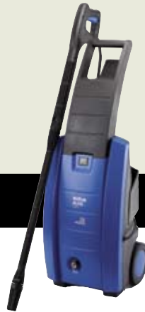
▲ C 120.2